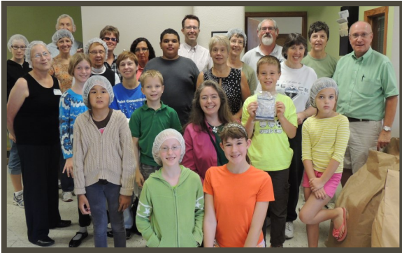
Kids Against Hunger